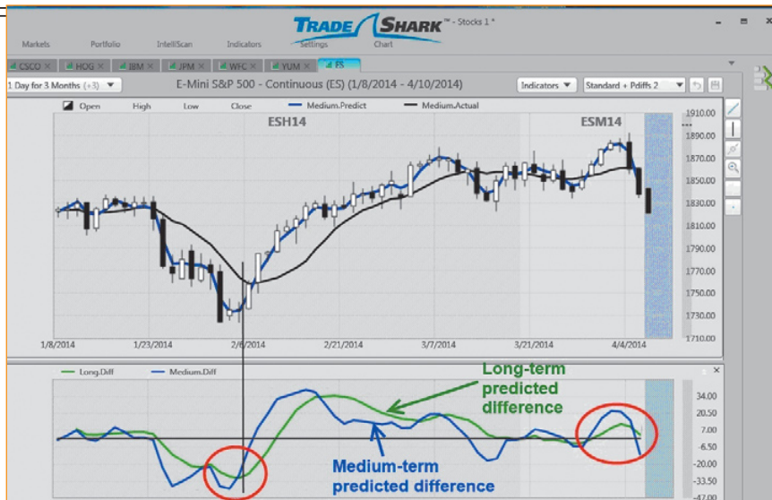
FIGURE 2: MARKET MOMENTUM. Here, the black vertical line highlights an area where the difference between the predicted and actual medium-term moving average has narrowed, causing the blue line to cross above the difference between the predicted and actual long-term moving average (green line). This is an early indication of momentum moving to the upside.

To be clear, however, as intuitive as the program might be, TradeShark is not a trading system and does not provide specific buy/sell signals. Instead, TradeShark is a predictive trading tool that uses the power of the computer and neural network pattern-recognition analysis to present innovative technical indicators that forecast their readings several days into the future. In other words, you still have to interpret TradeShark's clues and apply your trading skills to implement this tool.